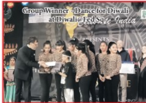
Group Winner - Dance for Diwali at Diwali@Fed Sq