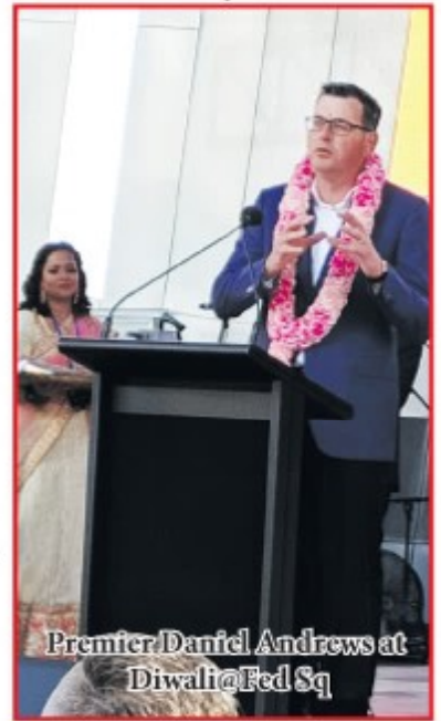
Premier Daniel Andrews at Diwali@Fed Sq