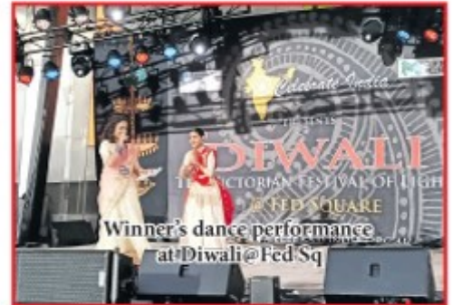
Winner's dance performance at Diwali@Fed Sq