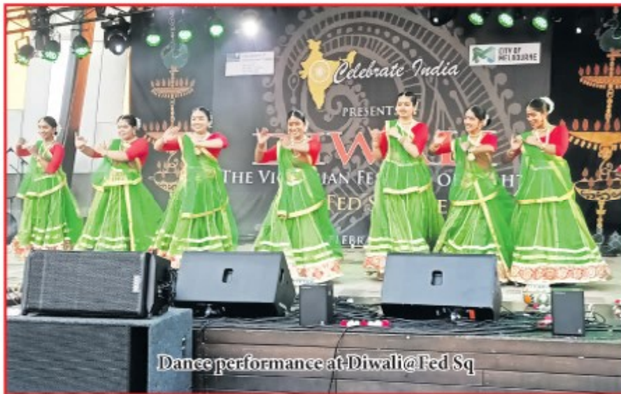
Dance performance at Diwali@Fed Sq

Launched on Monday 14 October, the week long celebrations included movie Dil Chahta Hai at Docklands, music and dance performances at BNourke Street Mall, movies Tanu Weds Manu and Hum Saath Saath Hain at Fed Square.