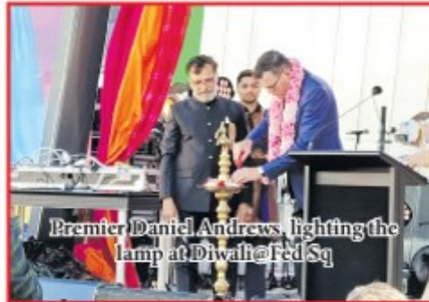
Premier Daniel Andrews lighting the lamp at Diwali@Fed Sq