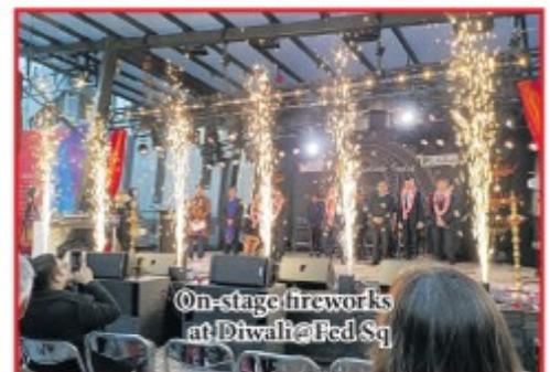
On-stage fireworks at Diwali@Fed Sq

illuminating the sky with joy and happiness in numbers and making it a gloriously done, it is incomprehensible to organize