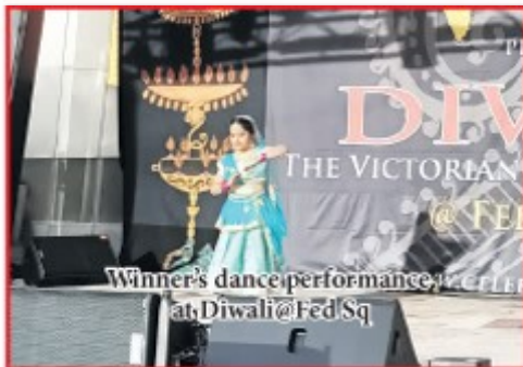
Winner's dance performance at Diwali@Fed Sq