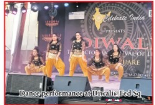
Dance performance at Diwali@Fed Sq