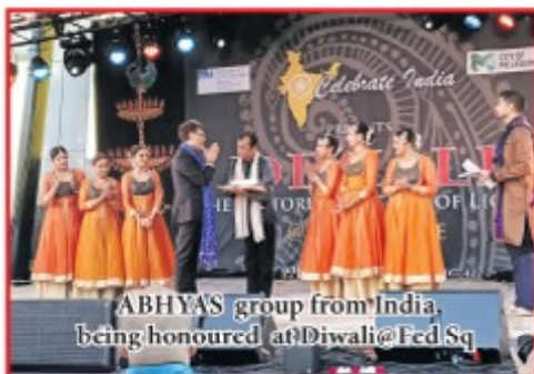
ABHYAS group from India being honoured at Diwali@Fed Sq