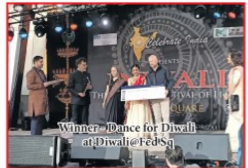
Winner - Dance for Diwali at Diwali@Fed Sq