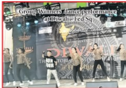
Group Winners dance performance at Diwali@Fed Sq