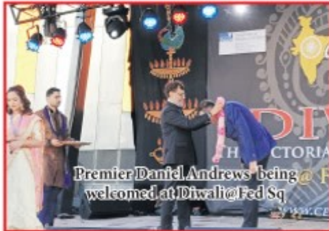
Premier Daniel Andrews being welcomed at Diwali@Fed Sq

the function without the support of Victorian government, Fed Square, City of Melbourne, and the AFL. See below through pics what you have missed out if you did not go.