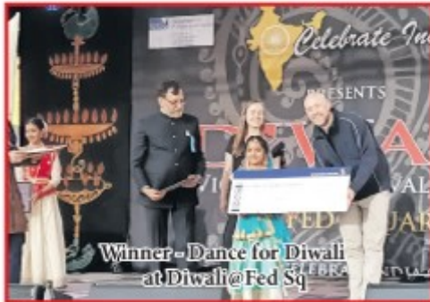
Winner - Dance for Diwali at Diwali@Fed Sq